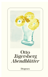
Evening Pages 176 pages 2024