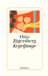
Pinboy 176 pages 2026