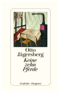
Poems 208 pages 2015