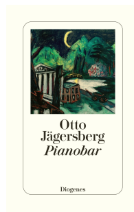
Piano Bar 272 pages 2021