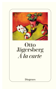
À la Carte 224 pages 2022