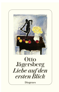
Love at First Sight 288 pages 2019