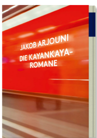
The Kayankaya Novels 1080 pages 2014

Jakob Arjouni, born 1964 in Frankfurt on the Main, has published novels, short stories, theatre and radio plays. Arjouni was only twenty-one years old when his acclaimed debut, ›Happy birthday, Turk!‹ was published and its main character, the Frankfurt-based private detective Kemal Kayankaya, took on his very first investigation. In 1991, the book was made into a film, directed by Doris Dörrie. Three further cases followed; for the third, ›One Man, One Murder‹, Jakob Arjouni was awarded the 1992 ›German Crime Fiction Prize‹. In autumn 2012, ›Brother Kemal‹, the fifth volume starring the German-Turkish investigator was published. The series is now firmly established as a classic amongst crime literature. Apart from his stage plays, his work also includes the Berlin novels ›Magic Hoffmann‹ (1996) and ›Holy Eddy‹ (2009) as well as ›Idiots. Five Fairy Tales‹ (2003). His novels ›Homework‹, ›Chez Max‹, and particularly his novel about an East-German Nazi follower, ›Cherryman Hunts Mister White‹, are now on school reading lists. The theme of addressing violence in all its forms runs through Arjouni's work like a red thread. His readers loved him for his thrilling, sharp-tongued, linguistically unpretentious, witty and clever books. He died on the 17th of January 2013 in Berlin. Jakob Arjouni's works have been published in 24 languages.