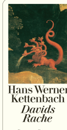
David's Revenge 304 pages 1994