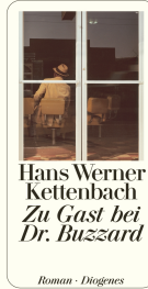
A Visit to Dr. Buzzard 368 pages 2006