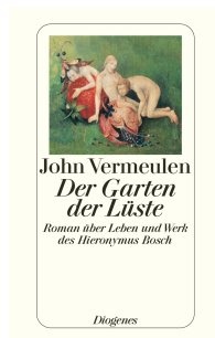
Garden of Earthly Delight 592 pages 2002