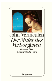
The Painter of the Shadows 592 pages 2011