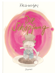
The Creation 56 pages 2002