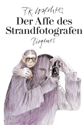
The Beach Photographer's Monkey 56 pages 2004