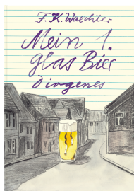
My First Glass of Beer 40 pages 1998