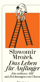
Life for Beginners 192 pages 2004