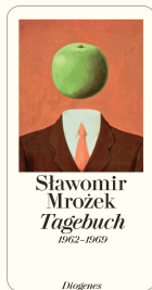
Journal 1962 - 1969 544 pages 2014

»Brilliant [...] the writer is an Aesop for our times.« – Publishers' Weekly, New York