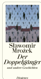
The Doppelgänger 272 pages 2000