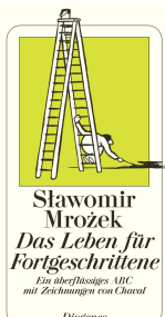
Life for the Advanced 240 pages 2006