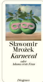
Carnival or The First Wife of Adam 80 pages 2014