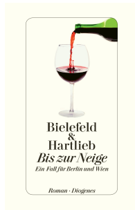
To the Very End 480 pages 2012