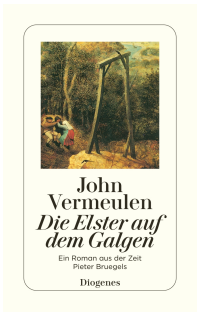
Magpie on the Gallows 496 pages 1995