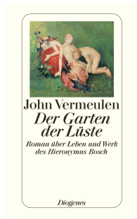
Garden of Earthly Delight 592 pages 2002