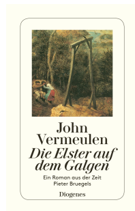
Magpie on the Gallows 496 pages 1995