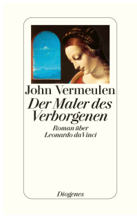
The Painter of the Shadows 592 pages 2011