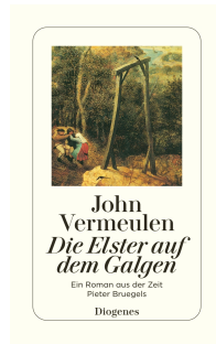
Magpie on the Gallows 496 pages 1995