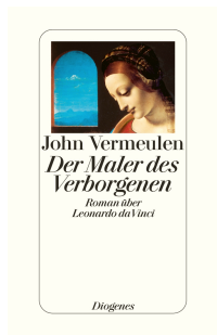
The Painter of the Shadows 592 pages 2011