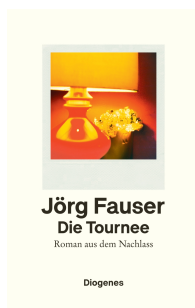
The Tour 288 pages 2022