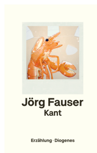
Kant 128 pages 2021