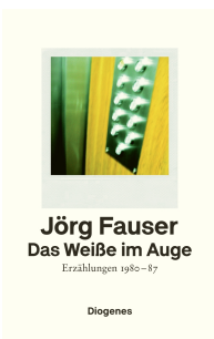
The White of the Eye 464 pages 2021