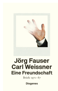
A Friendship 368 pages 2021