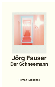
The Snowman 304 pages 2020