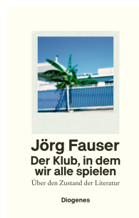
The Club We All Play In 400 pages 2020