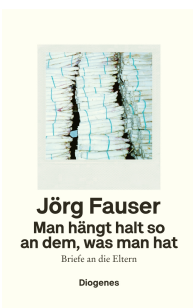
You Just Cling On to What You've Got 464 pages 2023