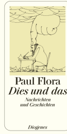
This and That 144 pages 1997