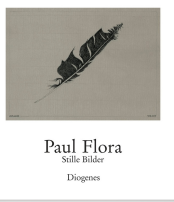
Silent Images 56 pages 2005