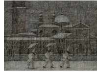
Drawings 1938-2001 244 pages 2002