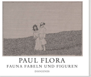
Fauna, Fables and Figures 68 pages 2008