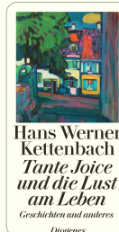
Aunt Joice and the Joy of Life 432 pages 2010