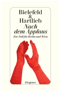
After the Curtain Falls 400 pages 2013