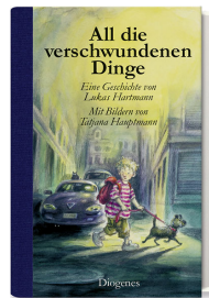
All the Missing Things 96 pages, 14.3 x 21.3 cm 2011