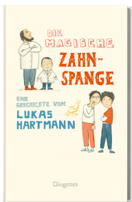
The Magic Braces 240 pages, 11.6 x 18.4 cm 2018

»Lukas Hartmann knows how to write history in a way that puts the present in a different light.« – Augsburg Allgemeine