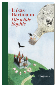
Wild Sophie 256 pages, 11.6 x 18.4 cm 2017