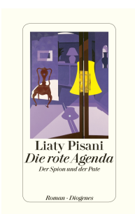
The Red Diary 416 pages 2012