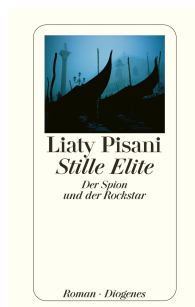
The Spy and the Rockstar 384 pages 2004