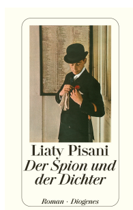
The Spy And the Poet 416 pages 1997