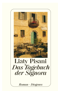
The Signora's Diary 288 pages 2007