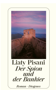
The Spy and the Banker 448 pages 1999