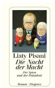
The Spy and the President 352 pages 2002