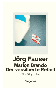
Marlon Brande 288 pages 2020