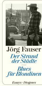
Jörg Fauser Der Strand der Städte Blues für Blondinen Essays · Diogenes

The Beach in the Cities / Blues for Blondes 352 pages 2009