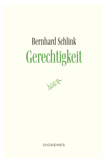
Justice 208 pages 2026

»The truly masterly aspect of Schlink's prose is its intelligence – an intelligence that is firmly rooted in common sense.« – Welt am Sonntag, Hamburg