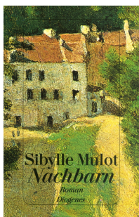
Neighbours 352 pages 1995