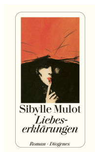
Declarations of Love 176 pages 1994