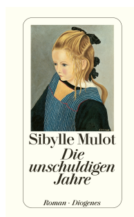
Innocent Years 240 pages 1999