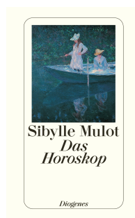
The Horoscope 128 pages 1997