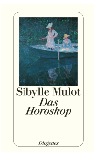
The Horoscope 128 pages 1997