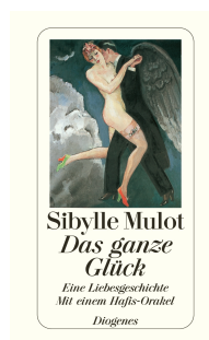
Perfect Happiness 176 pages 2001