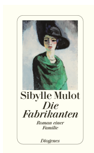
The Manufactures 400 pages 2005