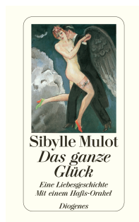
Perfect Happiness 176 pages 2001