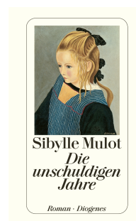
Innocent Years 240 pages 1999