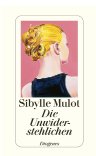
The Irresistibles 160 pages 2007