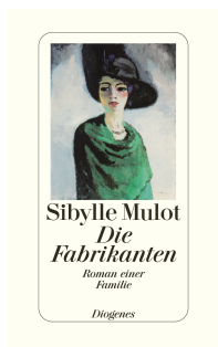
The Manufactures 400 pages 2005