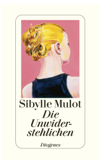
The Irresistibles 160 pages 2007