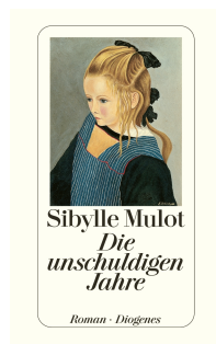
Innocent Years 240 pages 1999