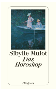
The Horoscope 128 pages 1997