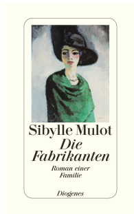
The Manufactures 400 pages 2005