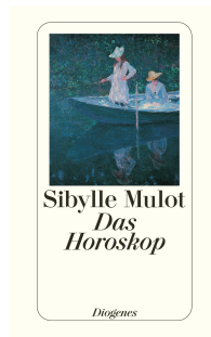
The Horoscope 128 pages 1997