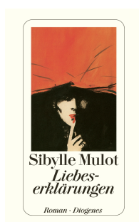
Declarations of Love 176 pages 1994