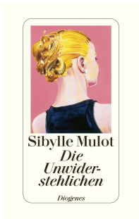
The Irresistibles 160 pages 2007