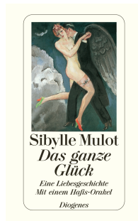
Perfect Happiness 176 pages 2001