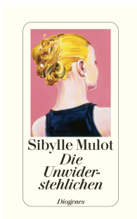
The Irresistibles 160 pages 2007