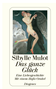
Perfect Happiness 176 pages 2001