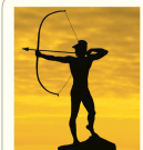
Petros Markaris Zahntag Ein Fall für Kostas Charitos Roman · Diogenes

Payday 432 pages 2012 🏆 Award winner 🏆 Bestseller