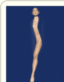
Petros Markaris Nachfalter Ein Fall für Kostas Charitos Roman · Diogenes

Che Committed Suicide 528 pages 2004 🏆 Award winner