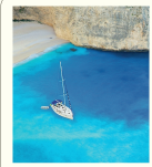
Petros Markaris Offshore Ein Fall für Kostas Charitos Roman · Diogenes