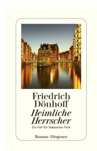
Secret Rulers 352 pages 2017