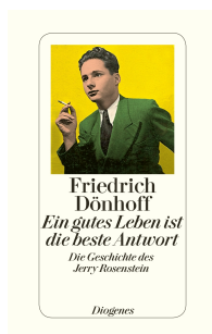
A Good Life it the Best Revenge 192 pages 2014