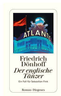
The English Dancer 304 pages 2010