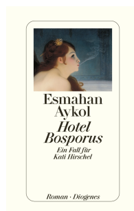
Hotel Bosporus 288 pages 2003