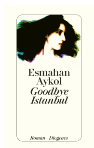
Goodbye Istanbul 368 pages 2007