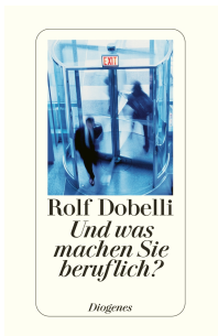
What Do You Do for a Living? 240 pages 2004