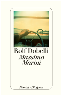
Massimo Marini 384 pages 2010