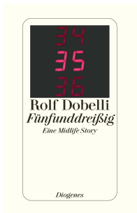
Thirty-five 208 pages 2003