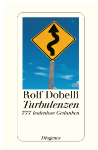
Turbulence 160 pages 2007