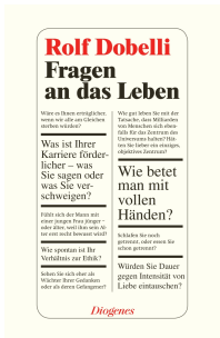
Questions to Ask of Life 208 pages 2014

Rolf Dobelli, born in Lucerne in 1966, studied philosophy and business management, worked for Swissair, founded a company and lived in Australia, Hong Kong, England and in the USA. He has published six books with Diogenes, most recently ›Massimo Marini‹, and with Carl Hanser Verlag his two non-fiction bestsellers ›The Art of Thinking Clearly‹ and ›The Art of Acting Clearly‹. Rolf Dobelli lives with his family in Berne.