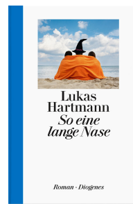
Such a Long Nose 208 pages, 11.6 × 18.4 cm 2010