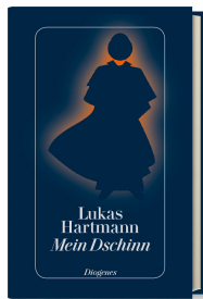
My Djinn 208 pages, 12.5 × 20 cm 2014