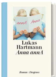
Anna annA 288 pages, 11.6 × 18.4 cm 2009