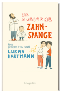
The Magic Braces 240 pages, 11.6 × 18.4 cm 2018

»Lukas Hartmann knows how to write history in a way that puts the present in a different light.« – Augsburg Allgemeine