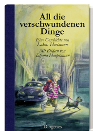
All the Missing Things 96 pages, 14.3 × 21.3 cm 2011