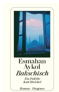
Baksheesh 336 pages 2004