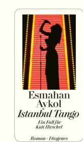
Istanbul Tango 336 pages 2016