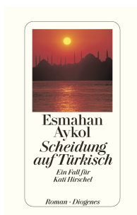
Divorce in Turkish 336 pages 2008