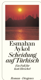
Divorce in Turkish 336 pages 2008