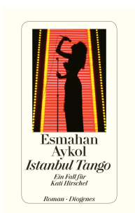
Istanbul Tango 336 pages 2016