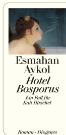
Hotel Bosporus 288 pages 2003