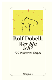
Who Am I? 144 pages 2007