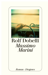
Massimo Marini 384 pages 2010