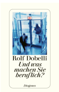
What Do You Do for a Living? 240 pages 2004