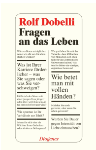
Questions to Ask of Life 208 pages 2014

Rolf Dobelli, born in Lucerne in 1966, studied philosophy and business management, worked for Swissair, founded a company and lived in Australia, Hong Kong, England and in the USA. He has published six books with Diogenes, most recently ›Massimo Marini‹, and with Carl Hanser Verlag his two non-fiction bestsellers ›The Art of Thinking Clearly‹ and ›The Art of Acting Clearly‹. Rolf Dobelli lives with his family in Berne.