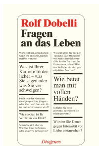
Questions to Ask of Life 208 pages 2014