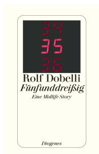
Thirty-five 208 pages 2003