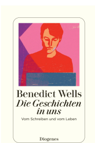
The Stories Inside Us 400 pages 2024

Benedict Wells, born in Munich in 1984, moved to Berlin after completing school and focused on his writing, earning a living with various jobs. His fourth novel, The End of Loneliness , spent more than a year and a half on the Spiegel Bestseller list, was awarded the 2016 ›European Union Prize for Literature‹, among other awards, and has been published in 39 languages. His latest novel Hard Land was awarded the independent young adult jury's ›German Youth Literature Award‹ in 2022. After several years in Barcelona, Benedict Wells now lives in Zurich.