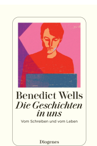
The Stories Inside Us 400 pages 2024 🏆 Bestseller

Benedict Wells, born in Munich in 1984, moved to Berlin after completing school and focused on his writing, earning a living with various jobs. His fourth novel, The End of Loneliness , spent more than a year and a half on the Spiegel Bestseller list, was awarded the 2016 ›European Union Prize for Literature‹, among other awards, and has been published in 39 languages. His latest novel Hard Land was awarded the independent young adult jury's ›German Youth Literature Award‹ in 2022. After several years in Barcelona, Benedict Wells now lives in Zurich.