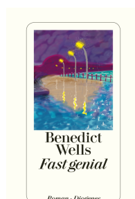
Almost Ingenious 336 pages 2011