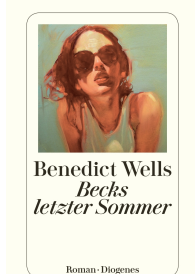
Beck's Last Summer 464 pages 2008 🏆 Award winner 🎬 Movie Adaptation