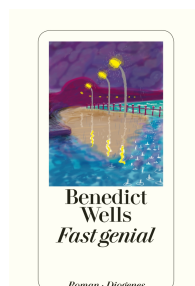
Almost Ingenious 336 pages 2011 🏆 Bestseller