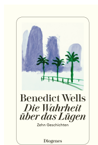
The Truth About Lying 256 pages 2018 🏆 Award winner 🏆 Bestseller