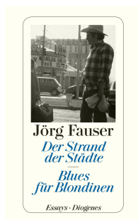
Jörg Fauser Der Strand der Städte / Blues für Blondinen Essays Diogenes The Beach in the Cities / Blues for Blondes 352 pages 2009