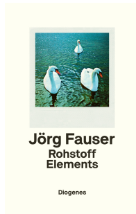
Jörg Fauser Rohstoff Elements Diogenes