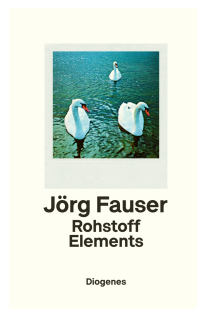
Jörg Fauser Rohstoff Elements Diogenes Raw Material Elements 320 pages 2019