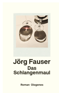
Jörg Fauser Das Schlangenmaul Roman Diogenes The Snake Mouth 320 pages 2019