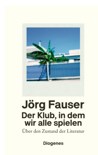
The Club We All Play In 400 pages 2020