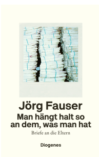
You Just Cling On to What You've Got 464 pages 2023

Jörg Fauser (1944 – 1987) was born near Frankfurt. After dropping out of university, he spent some years living in Istanbul and London, making a living in office jobs, as an airport worker and night watchman, among other things. In 1974, he switched to writing. His novels, poems, newspaper articles and short stories occupy an exceptional position in German literature. Jörg Fauser died in an accident on a motorway near Munich on the night after his birthday. »At first, I didn't want to become a professional writer, I just wanted to write. I imagined a normal existence while producing a few eternal things on the side.« Jörg Fauser