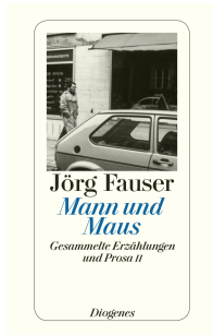
Jörg Fauser Mann und Maus Gesammelte Erzählungen und Prosa II Diogenes

The Beach in the Cities / Blues for Blondes 352 pages 2009