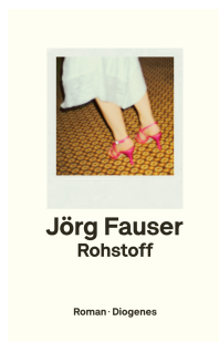
Jörg Fauser Rohstoff Roman Diogenes Raw Material 352 pages 2019