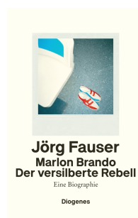
Marlon Brando 288 pages 2020