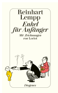
Grandchildren for Beginners 72 pages 1989