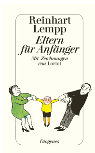
Parents for Beginners 64 pages 1973