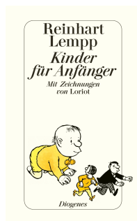
Children for Beginners 108 pages 1968