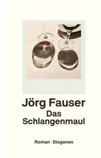
Jörg Fauser The Snake Mouth Das Schlangenmaul Roman · Diogenes