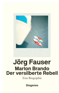
Jörg Fauser Marlon Brando Der versilberte Rebell Eine Biographie Diogenes Marlon Brando 288 pages 2020