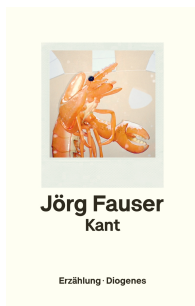
Jörg Fauser Kant Erzählung · Diogenes Kant 128 pages 2021