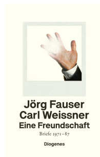
Jörg Fauser Carl Weissner Eine Freundschaft Briefe 1971–87 Diogenes A Friendship 368 pages 2021