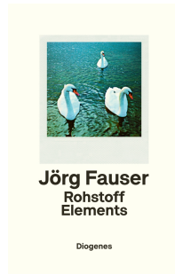
Jörg Fauser Raw Material Elements 320 pages 2019