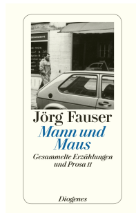
Jörg Fauser Man and Mouse 528 pages 2009