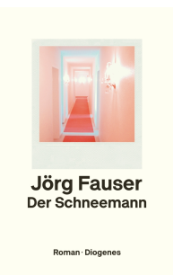
Jörg Fauser Der Schneemann Roman · Diogenes The Snowman 304 pages 2020