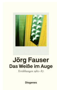
Jörg Fauser Das Weiße im Auge Erzählungen 1980–87 Diogenes The White of the Eye 464 pages 2021