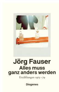
Jörg Fauser Alles muss ganz anders werden Erzählungen 1971–79 Diogenes Everything Must Be Completely Different 288 pages 2020