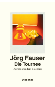
Jörg Fauser Die Tournee Roman aus dem Nachlass Diogenes The Tour 288 pages 2022

Jörg Fauser (1944 – 1987) was born near Frankfurt. After dropping out of university, he spent some years living in Istanbul and London, making a living in office jobs, as an airport worker and night watchman, among other things. In 1974, he switched to writing. His novels, poems, newspaper articles and short stories occupy an exceptional position in German literature. Jörg Fauser died in an accident on a motorway near Munich on the night after his birthday. »At first, I didn't want to become a professional writer, I just wanted to write. I imagined a normal existence while producing a few eternal things on the side.« Jörg Fauser