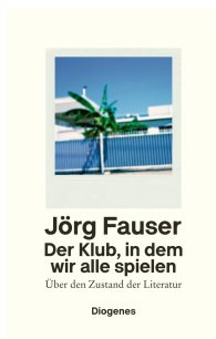
Jörg Fauser Der Klub, in dem wir alle spielen Über den Zustand der Literatur Diogenes The Club We All Play In 400 pages 2020