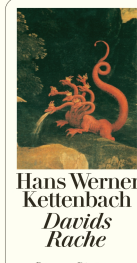
David's Revenge 304 pages 1994 Movie Adaptation