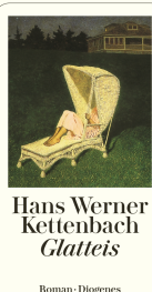
Black Ice 272 pages 2001 Movie Adaptation