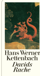
David's Revenge 304 pages 1994