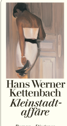
Small Town Affairs 512 pages 2004