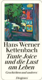
Aunt Joice and the Joy of Life 432 pages 2010

Hans Werner Kettenbach (1928 - 2018) studied many things over the years in four universities; he has worked as an advertising salesman, a shorthand secretary for the football magazine ›Kicker‹, a radio editor and finally as the editor of a newspaper. He wrote his first novel at the age of fifty. He has written a total of fourteen, five of which have been filmed. Critics have compared them to the works of Sjöwall/Wahlöö (›Plärrer‹), Simenon and Patricia Highsmith (›FAZ‹). In 2009 Kettenbach was awarded the ›Ehrengläuser‹ prize for crime writing for his life's work.