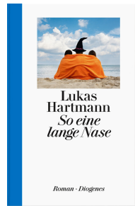
Such a Long Nose 208 pages, 11.6 × 18.4 cm 2010 🏆 Award winner