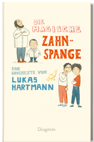
The Magic Braces 240 pages, 11.6 × 18.4 cm 2018

»Lukas Hartmann knows how to write history in a way that puts the present in a different light.« – Augsburgener Allgemeine