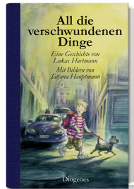
All the Missing Things 96 pages, 14.3 × 21.3 cm 2011