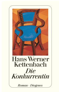
The Rival 528 pages 2002