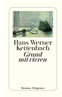
Grand With Four 240 pages 2000