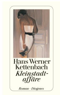
Small Town Affairs 512 pages 2004