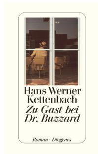
A Visit to Dr. Buzzard 368 pages 2006