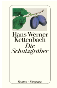
The Treasure-Hunters 544 pages 1998