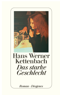
The Stronger Sex 448 pages 2009