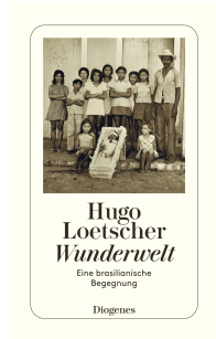
Was My Time My Time 192 pages 1983