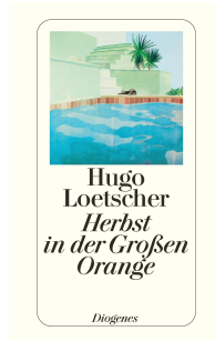
Autumn in the Big Orange 168 pages 1982