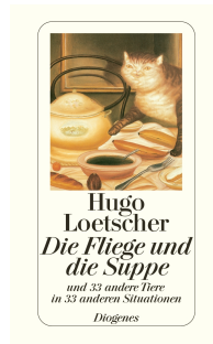
The Fly and the Soup 224 pages 1989