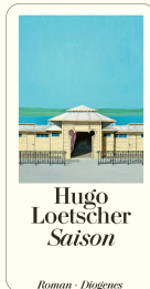
Season 416 pages 1995