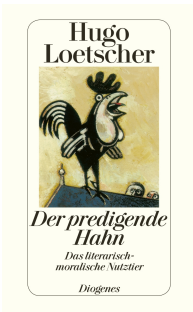
The Preaching Rooster 376 pages 1992