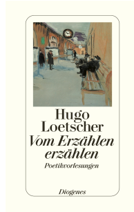
Telling about Story-Telling 176 pages 1988