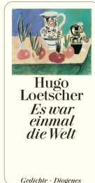
Once There Was the World 128 pages 2004