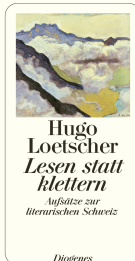
Read, Don't Climb! 448 pages 2003