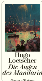
The Eyes of the Mandarin 384 pages 1999