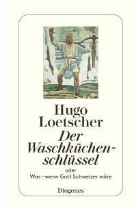
The Laundry Room Key 192 pages 1988