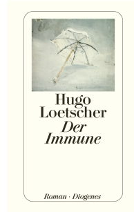
The Immune Man 448 pages 1985