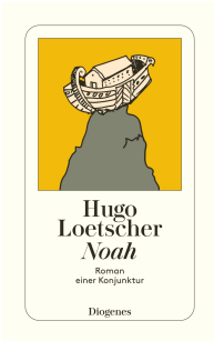
Noah 144 pages 1984