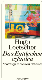
Inventing Discovery 384 pages 2016