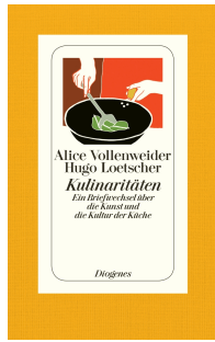
Culinarities 144 pages 1991