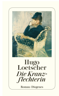
The Wreath Maker 192 pages 1989