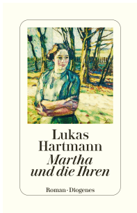
Martha and Her Kin 304 pages 2024 🏆 Bestseller