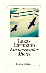
A Suitable Tenant 368 pages 2016 🏆 Bestseller