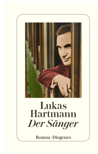
The Singer 288 pages 2019 🏆 Bestseller