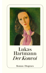
The Convoy 208 pages 2013