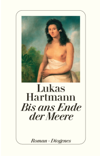
To the End of the Sea 496 pages 2009 🏆 Award winner 🏆 Bestseller