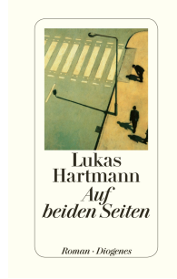
On Both Sides 336 pages 2015 🏆 Bestseller