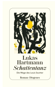
Shadow Dance 256 pages 2021 🏆 Bestseller