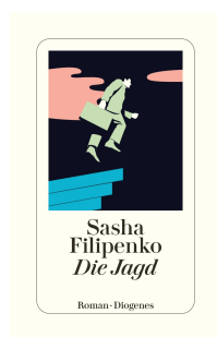
The Hunt 288 pages 2022 🏆 Award winner 📌 Bestseller