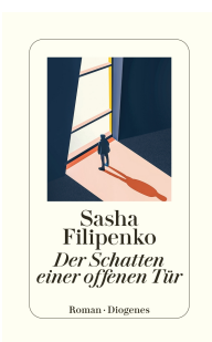
The Shadow of an Open Door 272 pages 2024 🏆 Award winner