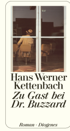
A Visit to Dr. Buzzard 368 pages 2006