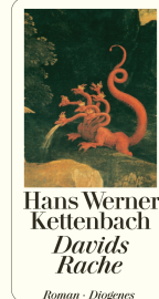
David's Revenge 304 pages 1994 Movie Adaptation