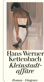
Small Town Affairs 512 pages 2004