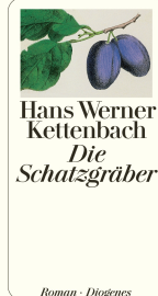
The Treasure-Hunters 544 pages 1998