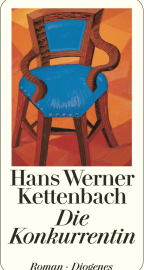
The Rival 528 pages 2002