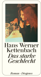
The Stronger Sex 448 pages 2009