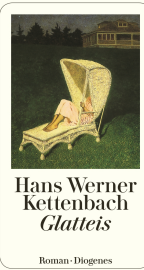
Black Ice 272 pages 2001 Movie Adaptation