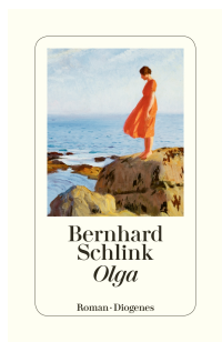
Olga 320 pages 2018 🏆 Bestseller