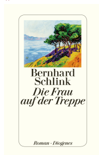
The Woman on the Stairs 256 pages 2014 🏆 Bestseller