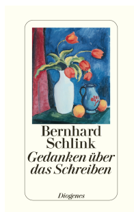
Thoughts on Writing 96 pages 2011