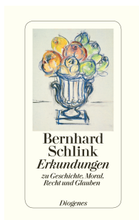
Explorations 288 pages 2015