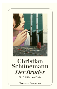
The Brother 288 pages 2008