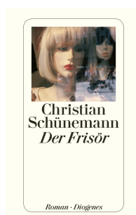
The Hairdresser 256 pages 2004 🏆 Award winner