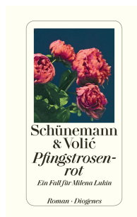
Peony Red 368 pages 2016