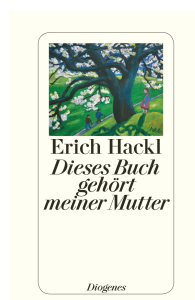
This Book Belongs to My Mother 128 pages 2013