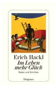
More Happiness in Life 432 pages 2019

»Erich Hackl's narrative is masterful and compelling.« – Der Tagesspiegel, Berlin