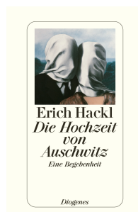
Wedding at Auschwitz 192 pages 2002 🏆 Award winner