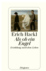
As If an Angel 176 pages 2007