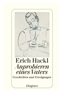
If the Father Fits 304 pages 2004