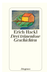
Three Tearless Stories 160 pages 2014