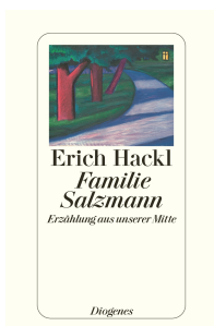
The Salzmann Family 192 pages 2010