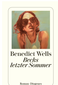
Beck's Last Summer 464 pages 2008