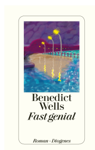
Almost Ingenious 336 pages 2011