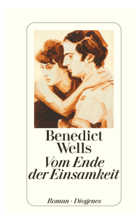
The End of Loneliness 368 pages 2016