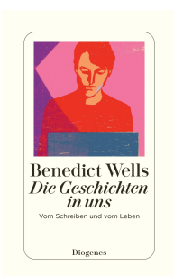
The Stories Inside Us 400 pages 2024

»If you want to convince a young person that reading is fun, you'd best offer him a book by Benedict Wells.« – NRC Handelsblad, Amsterdam