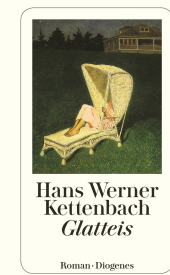
Black Ice 272 pages 2001