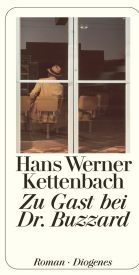
A Visit to Dr. Buzzard 368 pages 2006