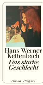
The Stronger Sex 448 pages 2009