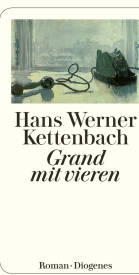
Grand With Four 240 pages 2000