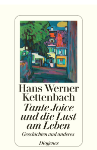
Aunt Joice and the Joy of Life 432 pages 2010