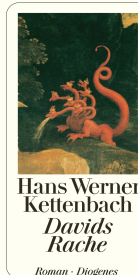
David's Revenge 304 pages 1994