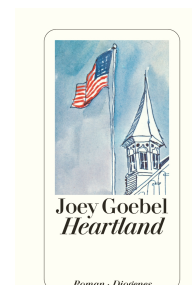
Commonwealth 720 pages 2009