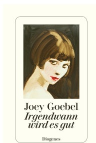
I Know It's Going to Happen for You Someday 320 pages 2019