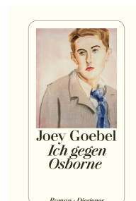
I Against Osbourne 432 pages 2013