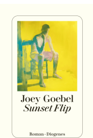
Sunset Flip 384 pages 2026