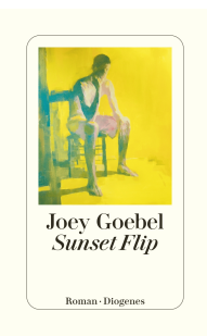
Sunset Flip 384 pages 2026