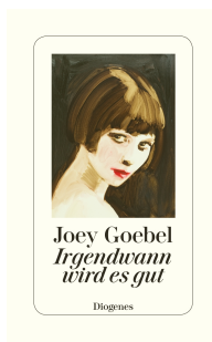
I Know It's Going to Happen for You Someday 320 pages 2019