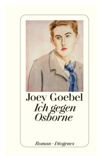
I Against Osbourne 432 pages 2013