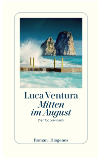
In the Middle of August 336 pages 2020