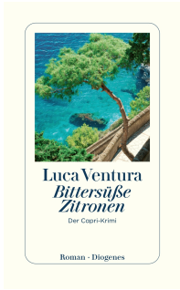
Bittersweet Lemons 320 pages 2021