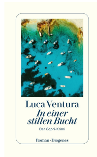
In a Hidden Cove 336 pages 2022