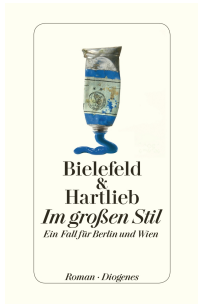
On a Grand Scale 416 pages 2015