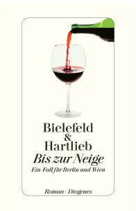
To the Very End 480 pages 2012