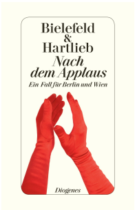
After the Curtain Falls 400 pages 2013