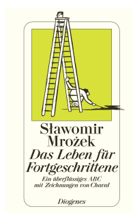
Life for the Advanced 240 pages 2006