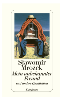
My Unknown Friend 192 pages 1999