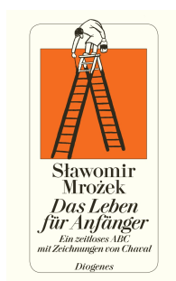
Life for Beginners 192 pages 2004