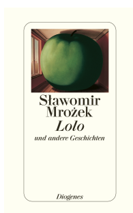
Lolo 304 pages 2000