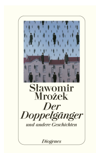
The Doppelgänger 272 pages 2000